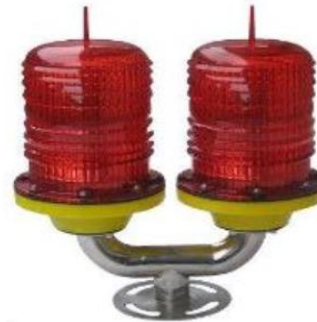
Double Head Series