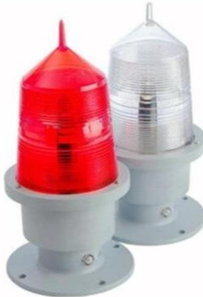
20W/ 30W Single head Seires