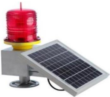
10W Solar LED Aviation Obstruction Light